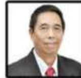
PDG. TEODORO LOCSON COUNCIL ON LEGISLATION DISTRICT REPRESENTATIVE